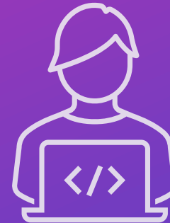
Solving technical errors efficiently

Wi-Fi ensures maximum wireless broadband throughput, so subscribers have an uninterrupted experience across various high-demand applications